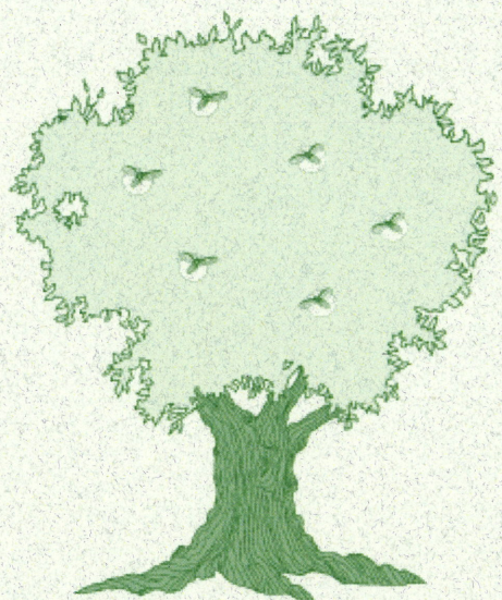
"the gathering tree"

We are a worldwide organization for interpreters, educators, and designers who are committed to enriching the experience of leisure visitors with this planet's natural and cultural treasures, developing a serious educational response to its environmental problems, and fostering contemplative experiences to nurture deeper human relationships with its ecological systems and communities.